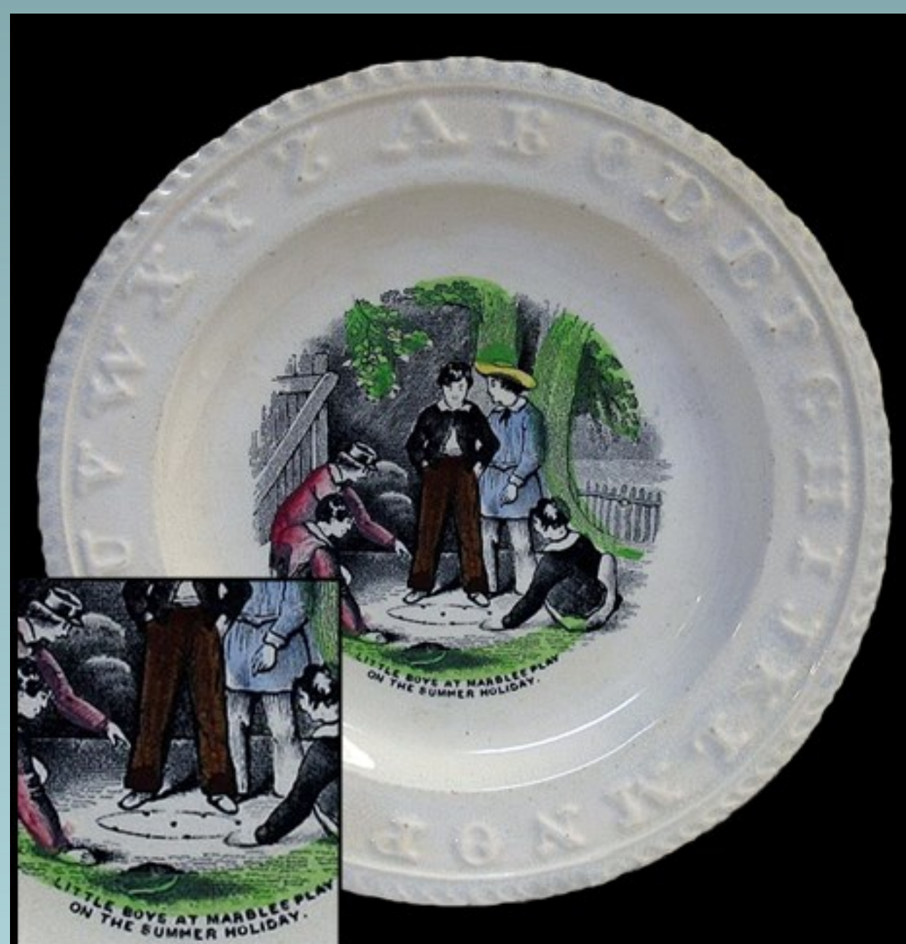
A British alphabet plate, probably last quarter of the 19th century, showing boys playing marbles on summer holiday. 6" in diameter. Private collection. (close-up bottom left).

W hile marbles are a relatively common find on nineteenth-century archaeological sites, what makes these marbles a bit unusual is that all seven of them were found together. It is easy to imagine them nestled in a leather or cloth bag, awaiting their next game.